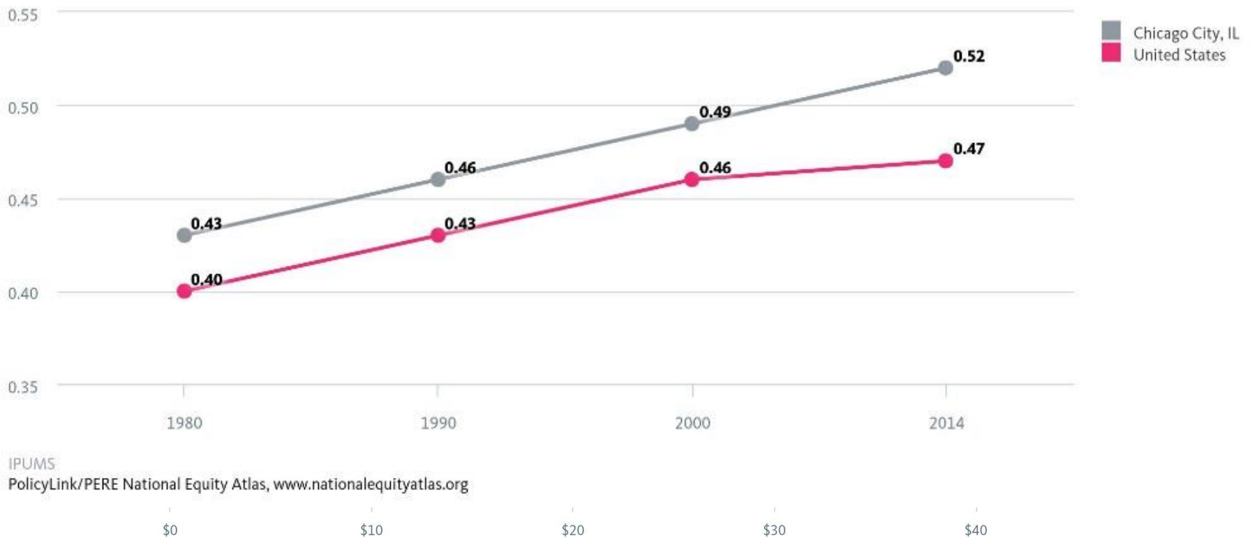
Gini coefficient: Chicago City, IL vs. U.S., 1980-2014

IPUMS PolicyLink/PERE National Equity Atlas, www.nationalequityatlas.org